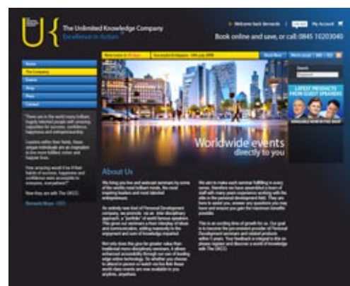
Screen shots from theukco.com